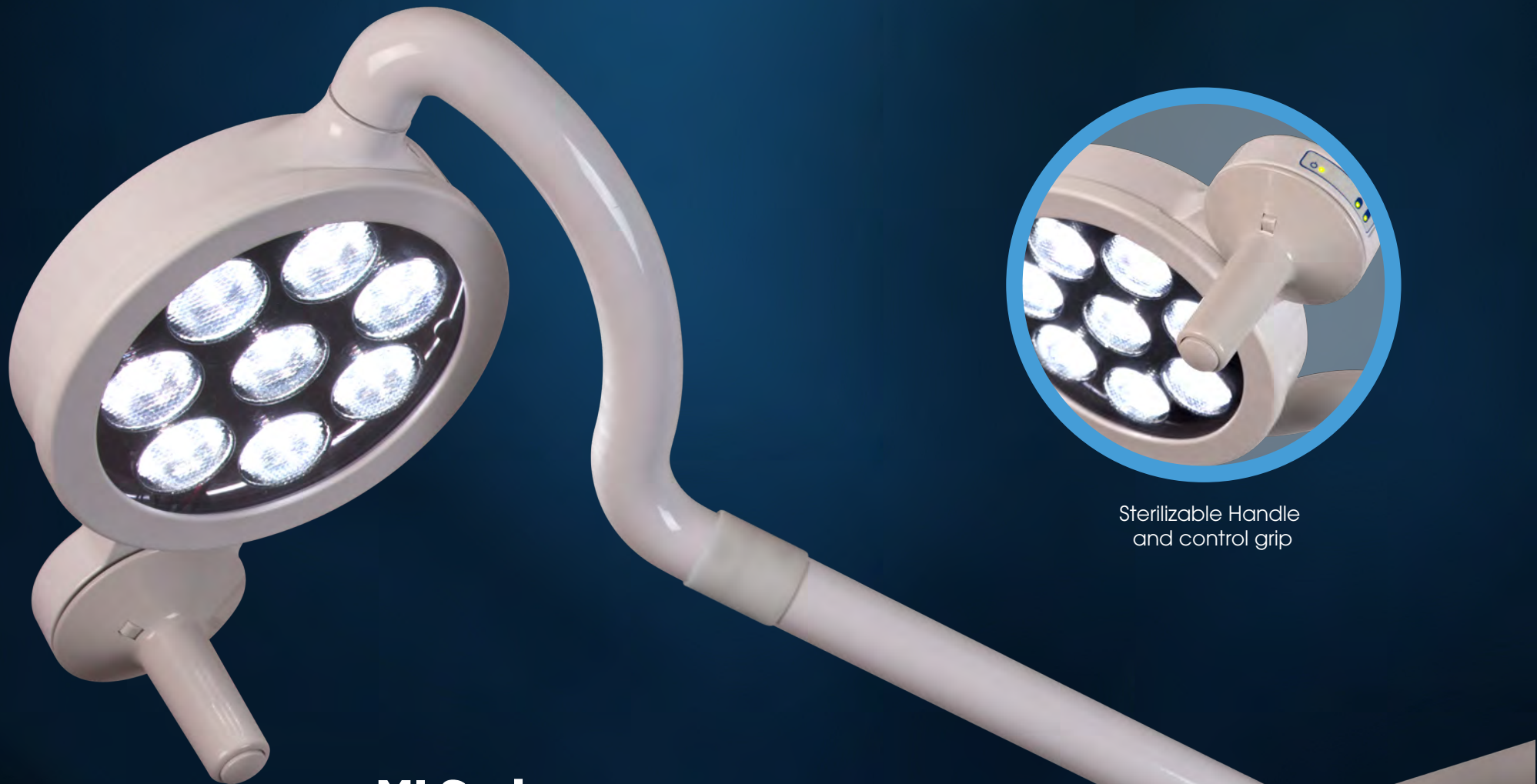
Sterilizable Handle and control grip