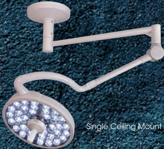
Single Ceiling Mount