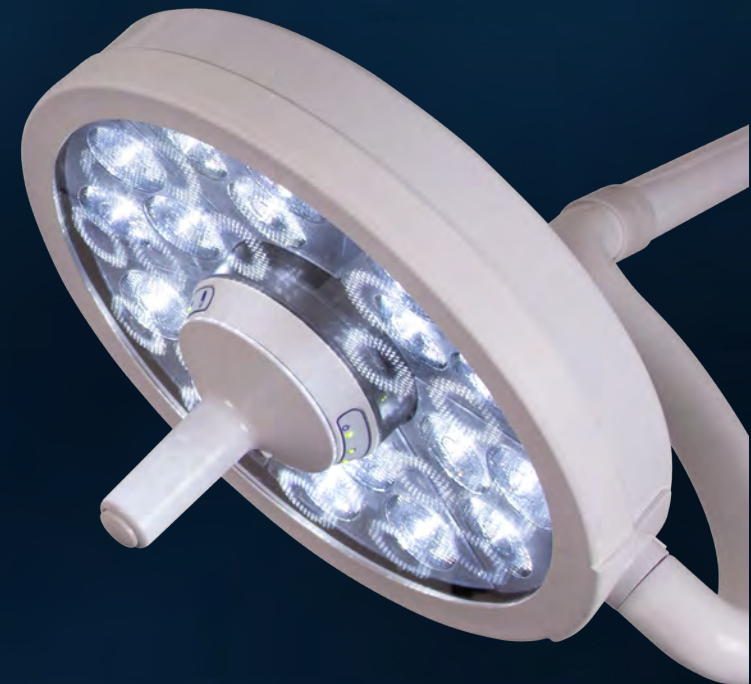
MI-750 Dual Ceiling Mount