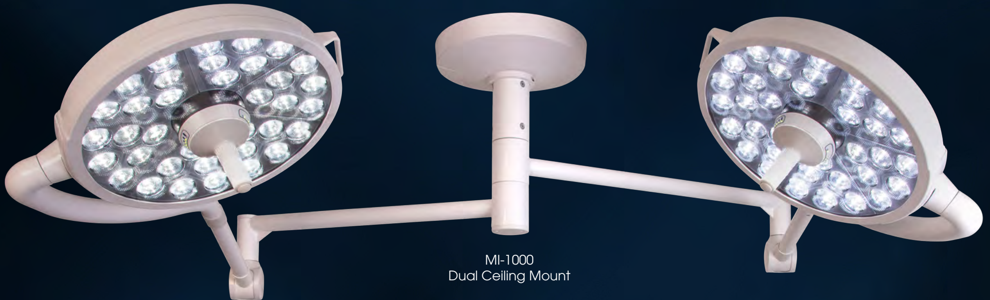
MI-1000 Dual Ceiling Mount