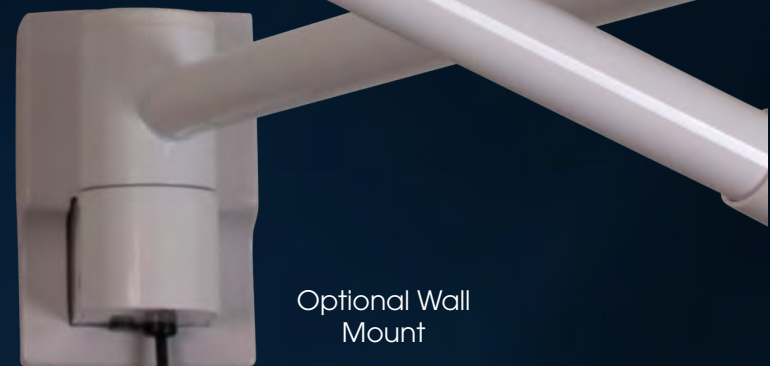
Optional Wall Mount