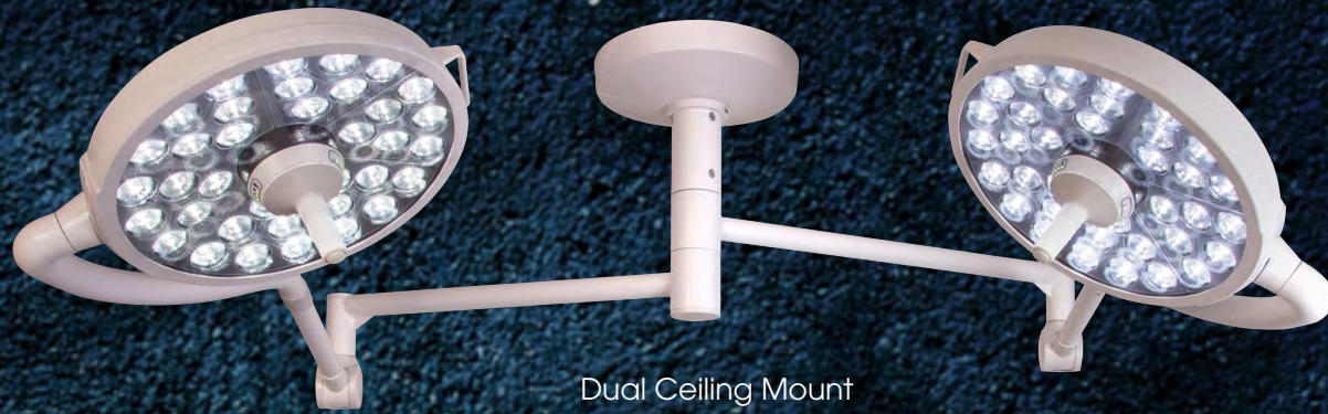
Dual Ceiling Mount