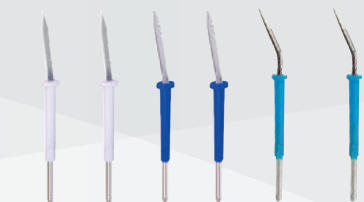
A804, A805, A806, A807, A806DE, A807DE